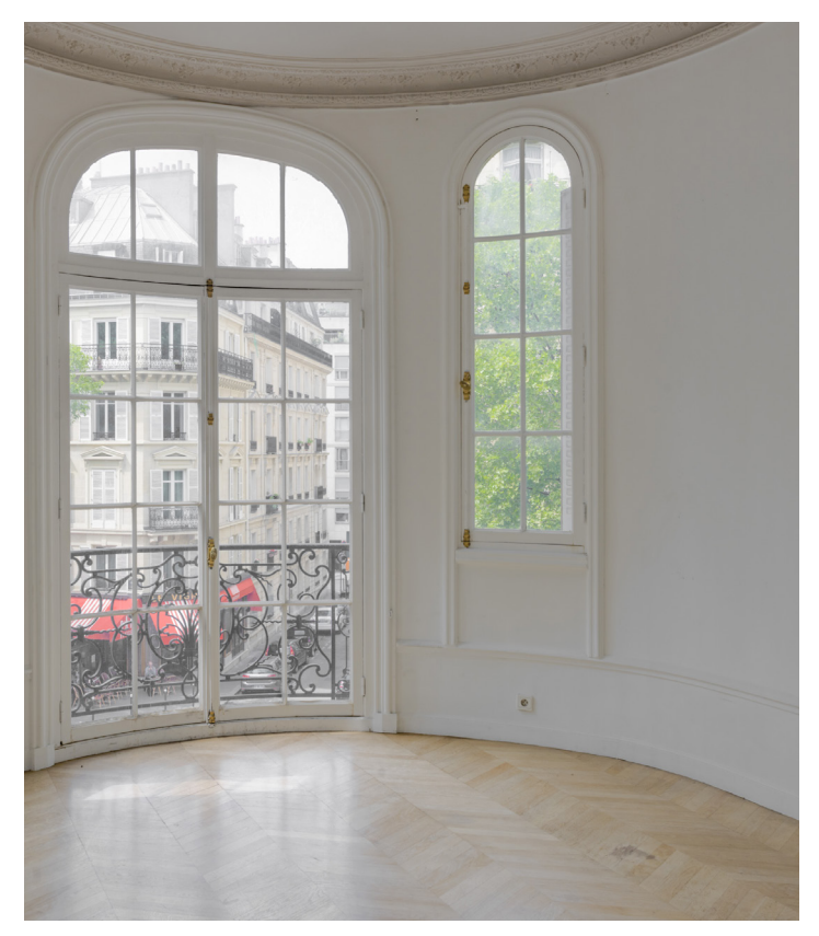
Paris Internationale 10/06/2018 - @Paris Internationale