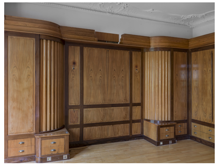
Paris Internationale 10/06/2018 - @Paris Internationale