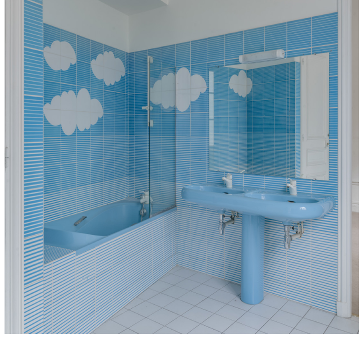
Paris Internationale 10/06/2018