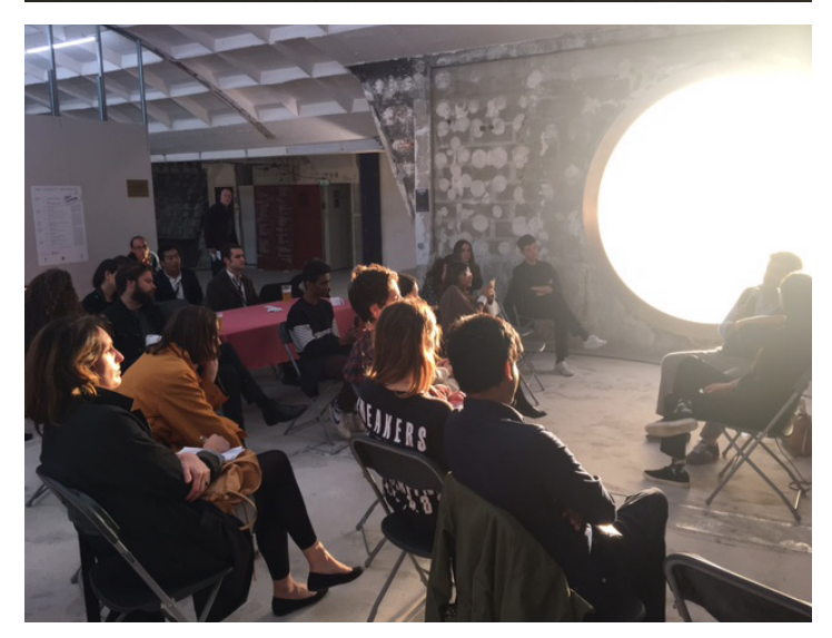
Paris Internationale 10/06/2018 - @ Paris Internationale