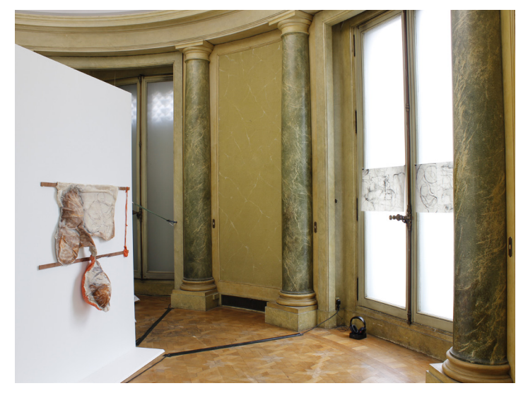
Paris Internationale 10/06/2018