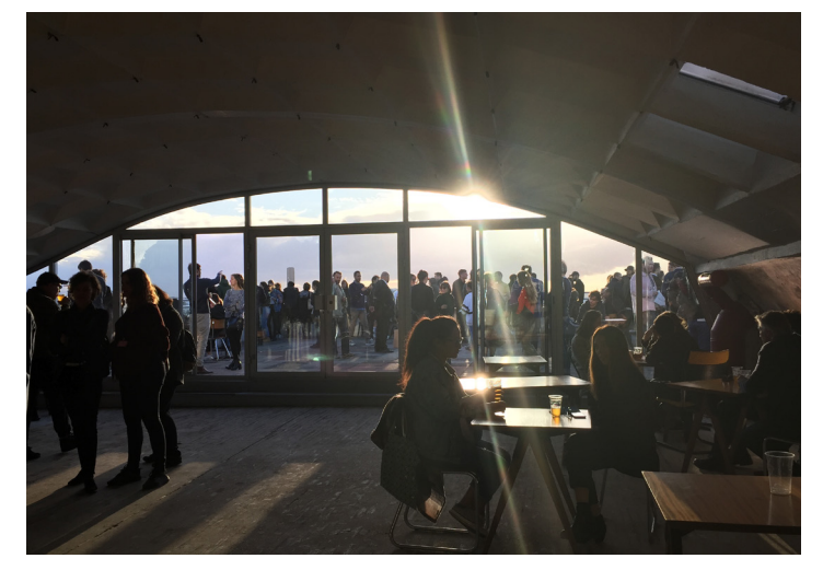
Paris Internationale 10/06/2018 - @Paris Internationale