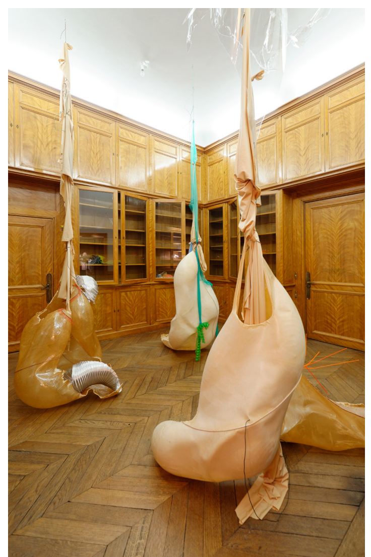
Paris Internationale 10/06/2018 - @Paris Internationale